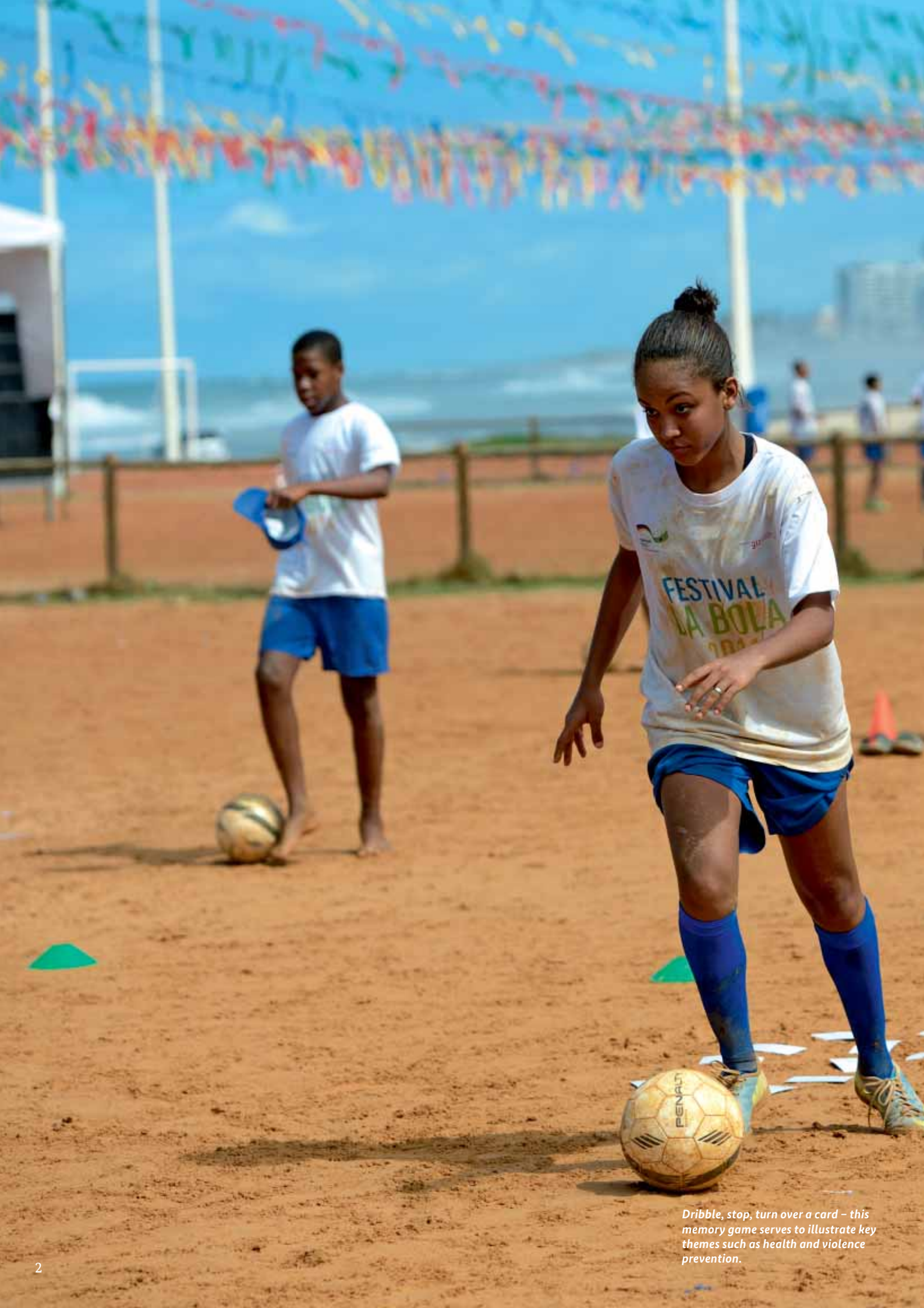
Dribble, stop, turn over a card – this memory game serves to illustrate key themes such as health and violence prevention.