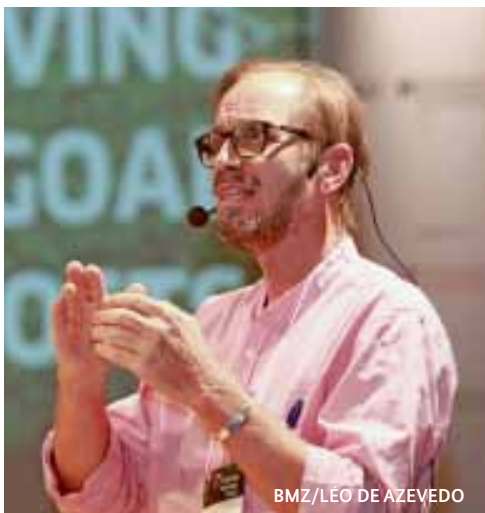
BMZ/LÉO DE AZEVEDO